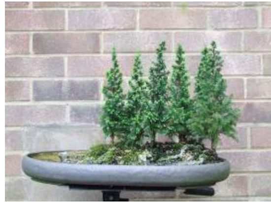
1 tree multiple rocks