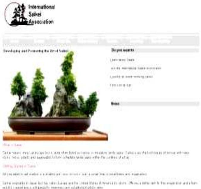
Page from the new website

As soon as it is up and running we will let people know, but it should be by the end of September.